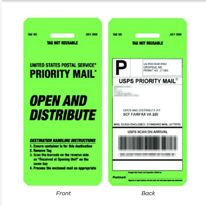
Figure 2. Green PMOD Tag – Processing Plant PMOD Sacks