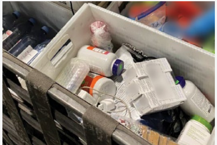
Figure 4. Non-Prescription Medications Found Loose in the Mail