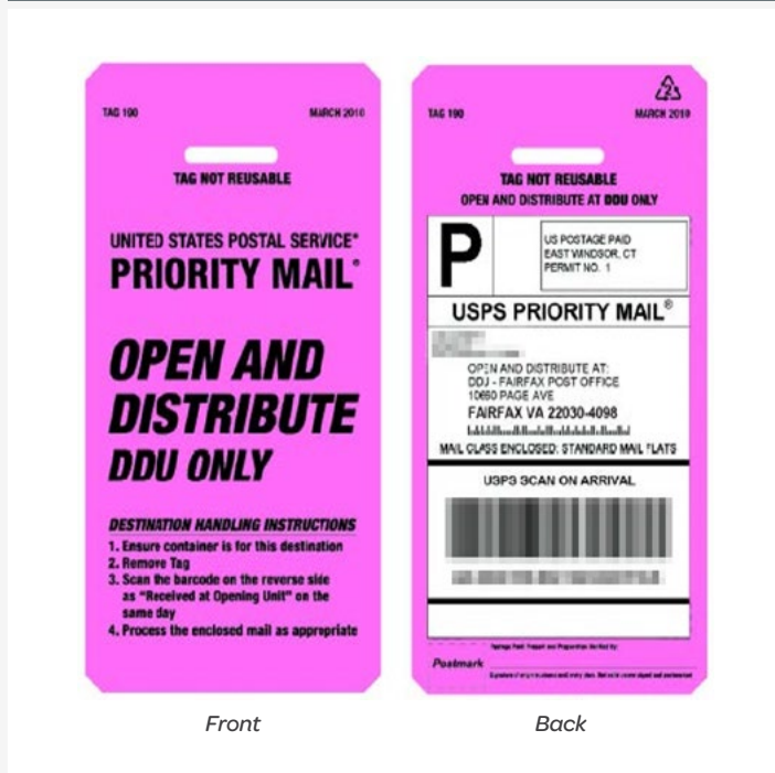
Figure 3. Pink PMOD Tag – Delivery Unit PMOD Sacks