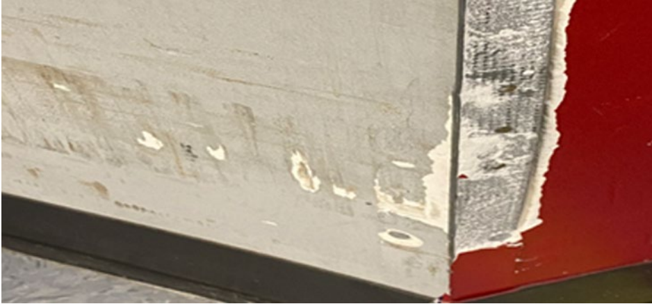
Figure 5. Damaged Walls