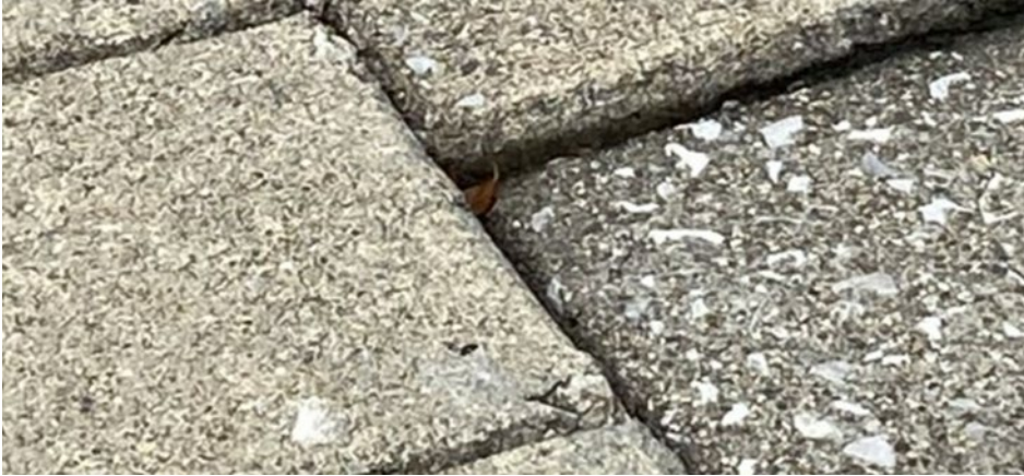
Figure 11. Uneven Sidewalk