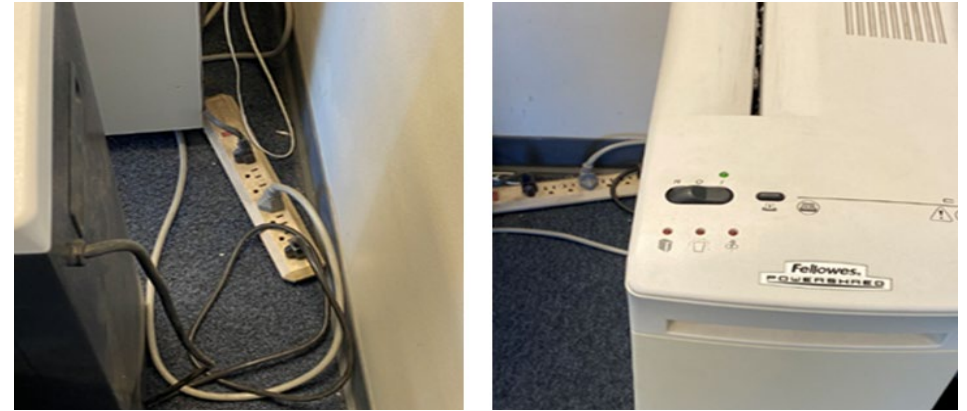
Figure 9. Paper Shredder and Copy Machine Plugged into Surge Protector