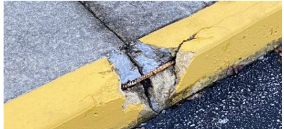
Figure 7. Damaged Sidewalk Curb