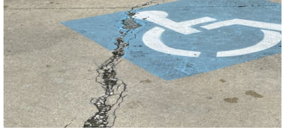
Figure 13. Cracked Asphalt