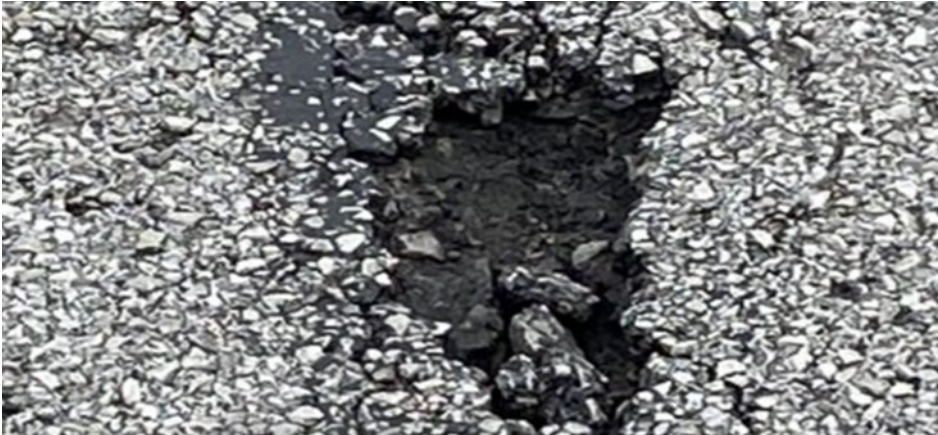
Figure 12. Pothole in Customer Parking Lot