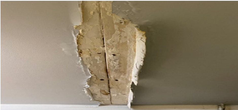
Figure 2. Peeling Ceiling Coverings