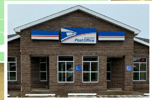
Whitley City Post Office