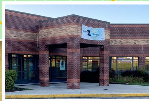
Monticello Post Office