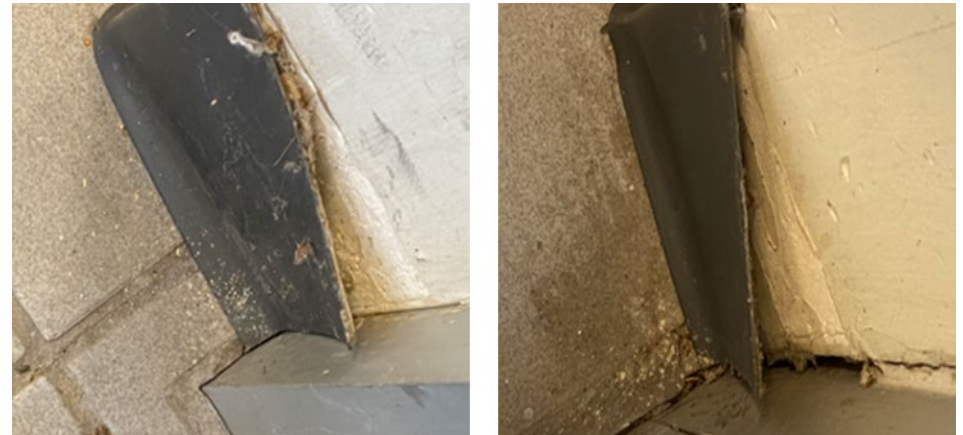
Figure 8. Partially Detached Baseboard Strips