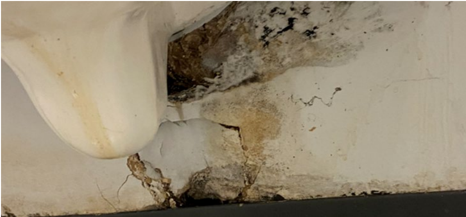
Figure 1. Damaged Wall Under Urinal

Source: U.S. Postal Service Office of Inspector General (OIG) photo taken August 17, 2021.