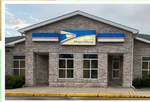
West Somerset Post Office

Report Number 21-227-R22 | November 18, 2021