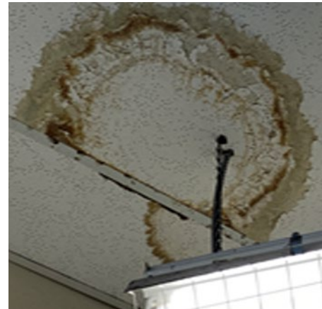
Figure 3. Stained Ceiling Tiles