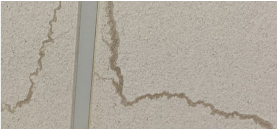
Figure 6. Stained Ceiling Tiles in Lobby