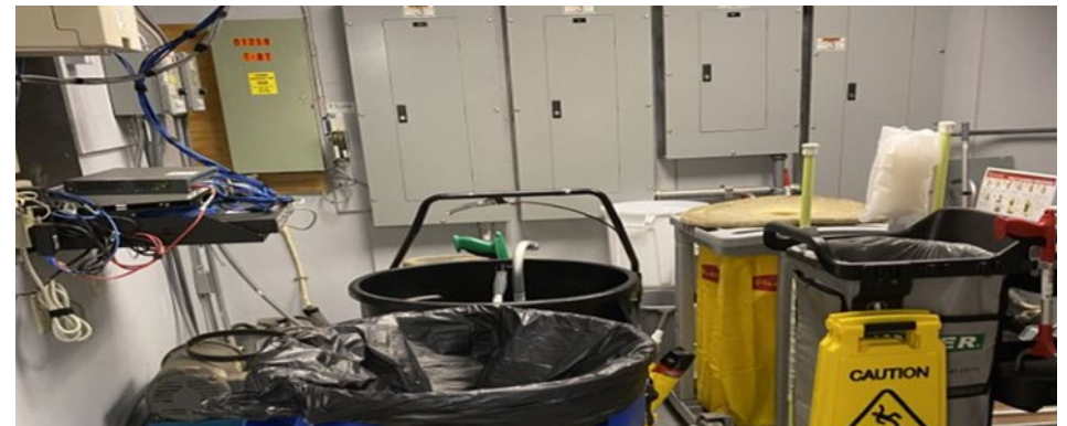
Figure 10. Blocked Electrical Panels