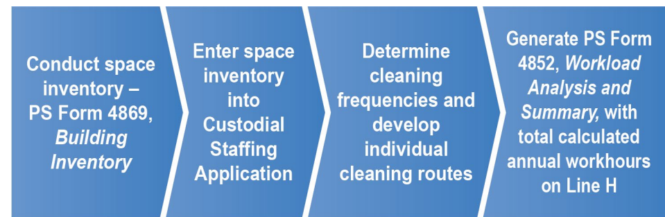
Figure 1. Process Flow – Determining Line H Workhours

Cleaning (CTC) program, a methodology for systematically cleaning facilities. The CTC program requires management to conduct a space inventory to measure the interior and exterior spaces of a building. 3 Management enters space inventory items into the Custodial Staffing Application and use them to determine cleaning frequency and develop individual cleaning routes. The application generates a PS Form 4852, which shows the total calculated annual workhours on Line H and the number of employees needed to perform the workhours on Line K (see Figure 1).