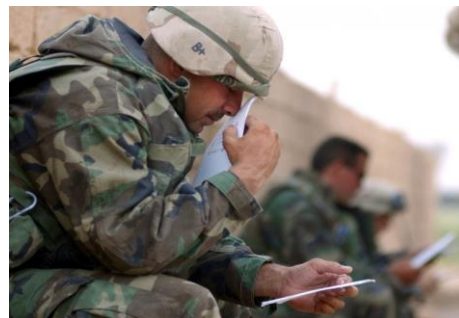
Throughout the military's history, USPS has been a connection between soldiers and their families.

Whether you're new to USPS or a seasoned veteran employee, the goal is to make both our veteran employees and the overall organization stronger by giving you helpful information, great ideas and useful tips from our own veteran